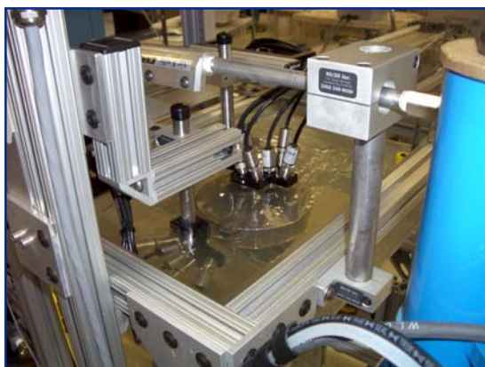
Figure 2.: UT inspection station.